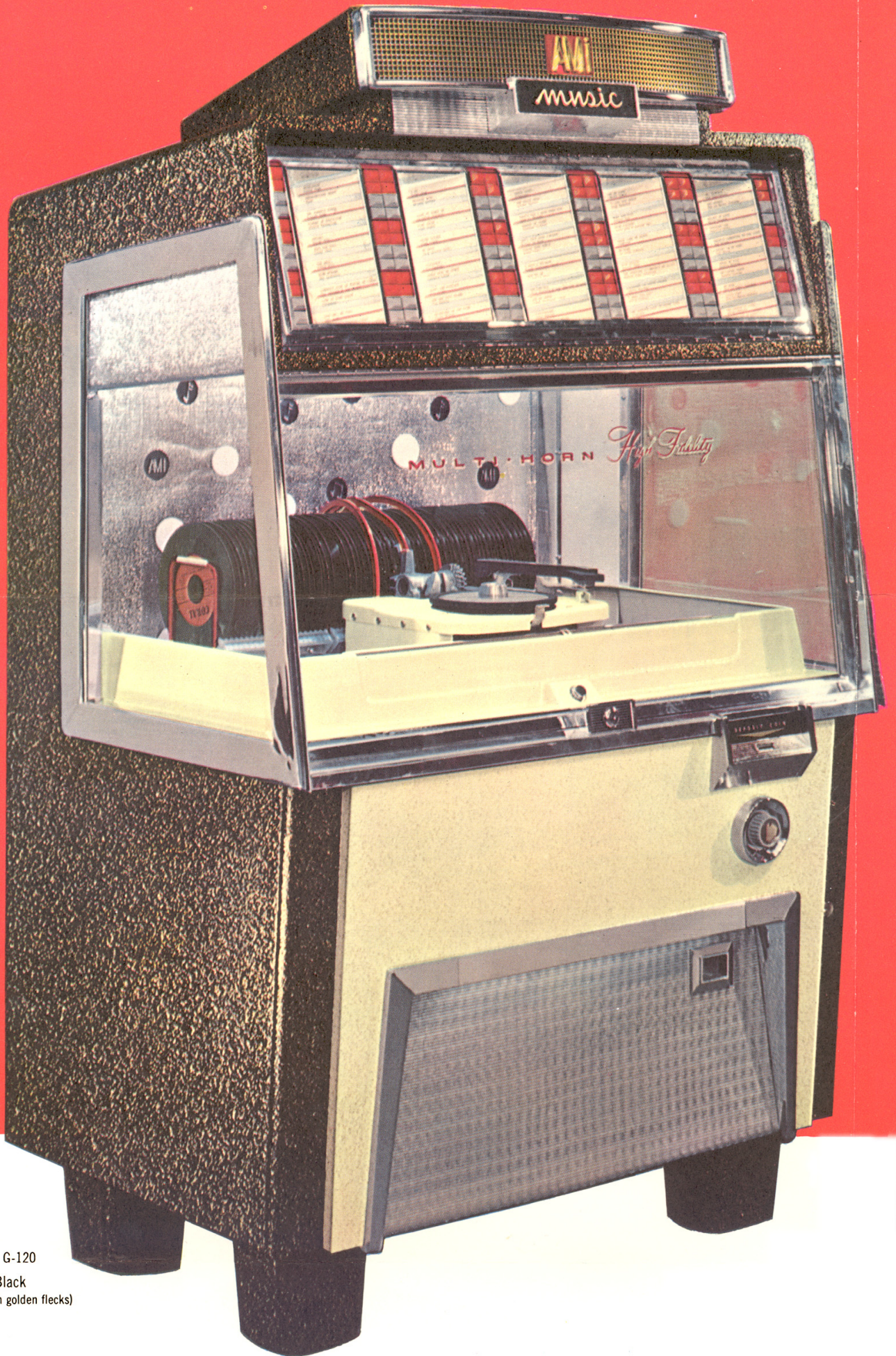
AMI Model G-120 Night-sky Black (Jet black with golden flecks)