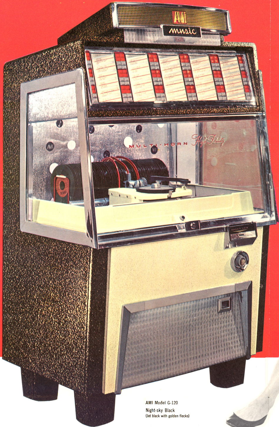
AMI Model G-120 Night-sky Black (Let black with golden flecks)